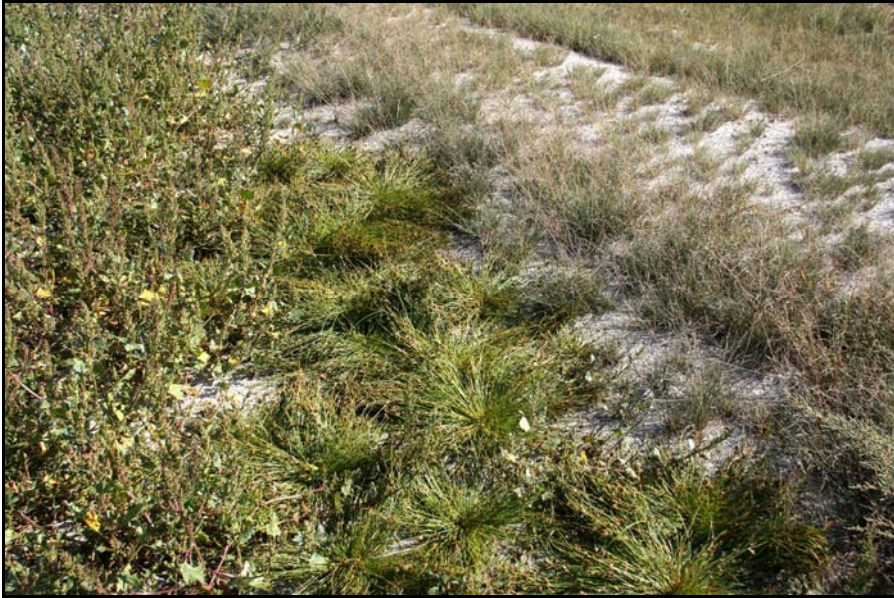
Fig. 3. - Association Cyperetum pannonicum Wendelberger 1943 in Lake Medura near Ridica village.

salinae Slavnić 1948, association Cyperetum pannonicum Wendelberger 1943 (Fig. 3).