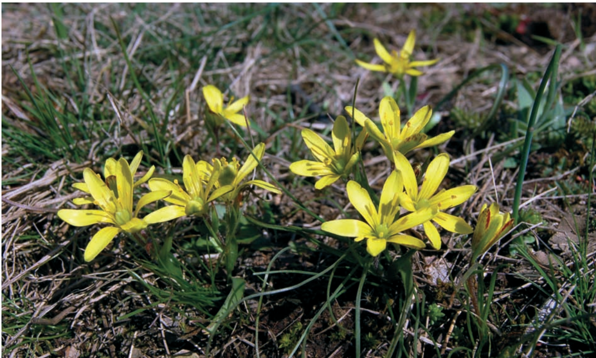
Figure 3: Gagea bohemica subsp. bohemica var. stenochlamydea in Žibrica Nature Reserve (Tribeč Mts.).

Subsp. saxatilis was found only at a single locality near the Vinosady settlement (Fig. 2). The taxon (as G. bohemica ) was mentioned here since the end of the fifties of the last century (Ptačovský