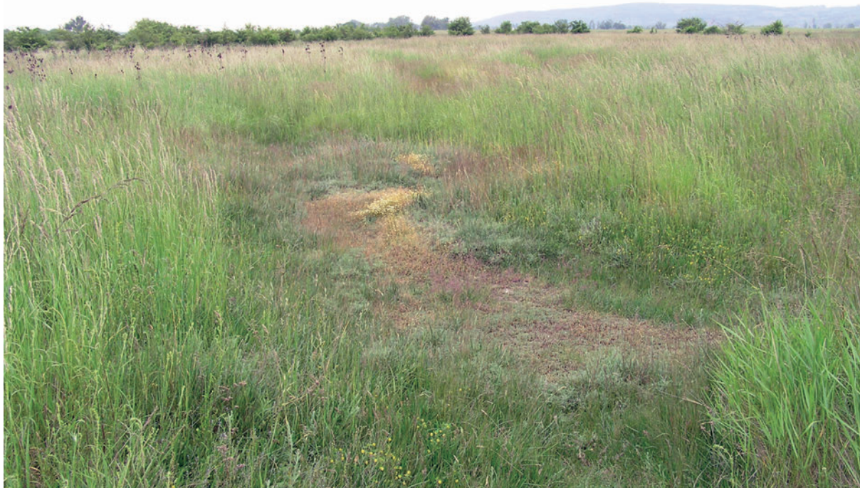
Figure 3: Absence of traditional management and desalinization of soil has caused reduction of population size of Artemisia santonicum subsp. patens in the Kamenínske slanisko Nature Reserve.

Slika 3: Odsotnost tradicionalnega gospodarjenja in razsoljevanje tal sta zmanjšala populacijo Artemisia santonicum subsp. patens v Naravnem rezervatu Kamenínske slanisko.