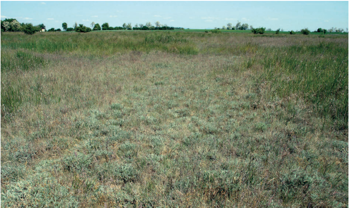
Figure 2: Relatively large stand of Artemisia santonicum subsp. patens surrounded by vegetation of Molinio-Arrhenatheretea in Malé Čiky site.

Slika 2: Relativno velik sestoj vrste Artemisia santonicum subsp. patens , ki ga obkroža vegetacija razreda Molinio-Arrhenatheretea na lokaliteti Malé Čiky.