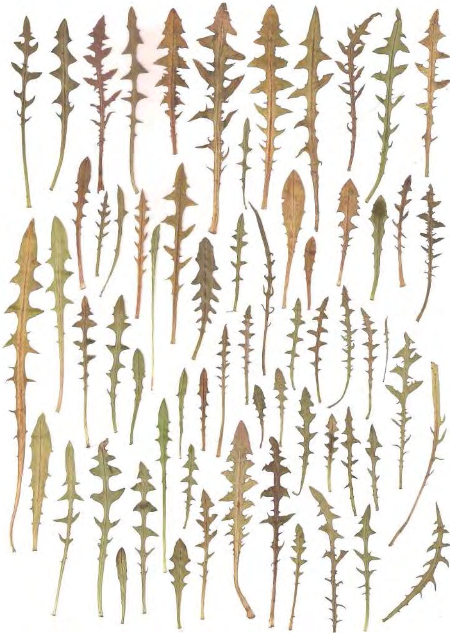
Fig. 1. Variability of leaves from all present micro-localities from Košice (leg. DUDÁŠ 2015 KO).