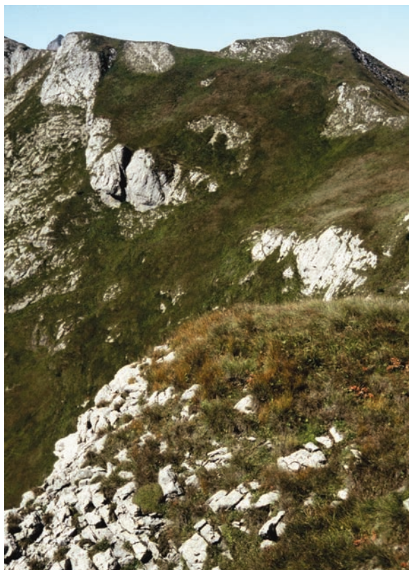
Figure 1: A general view on the typical biotope of the association Oxytropido carpaticeae-Elynetum on limestone in the Belianske Tatry Mts.

Slika 1: Pogled na tipično rastišče asociacije Oxytropido carpaticeae-Elynetum na apnencu v gorovju Belianske Tatry.