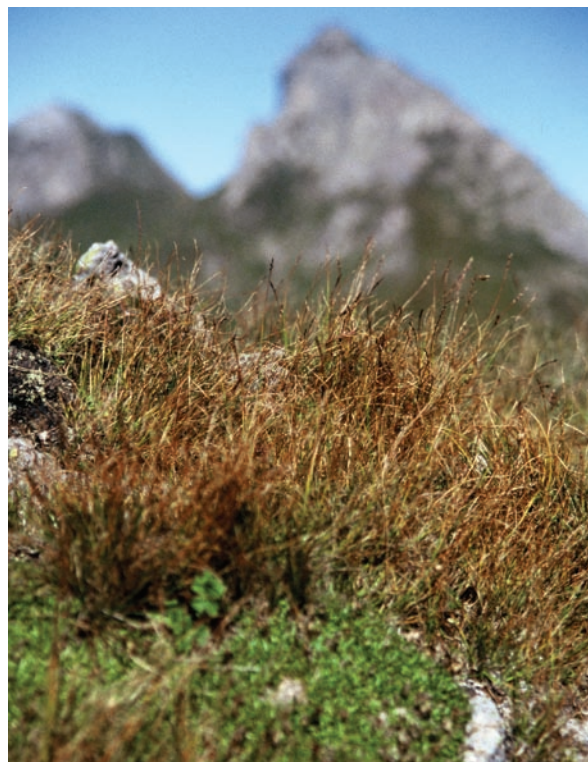
Figure 2. A tuft of wiry ( Elyna myosuroides ) is a dominant species.

Recently only two associations, namely Oxytropido carpaticeae-Elynetum (Puşcaru & al. 1956) Coldea