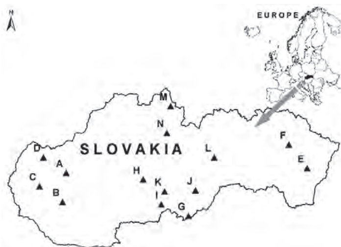
Fig. 1. The distribution of selected reservoirs in Slovakia.

Abbreviations of surveyed reservoirs: A (Sĺňava), B (Kráľová), C (Budmerice), D (Kunov), E (Zemplínska Šírava), F (Veľká Domaša), G (Petrovce), H (Môťová), I (Luboreč), J (Teplý vrch), K (Ružiná), L (Palcmanšká Maša), M (Orava), N (Liptovská Mara).