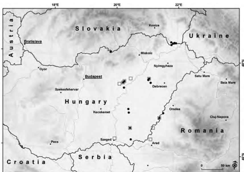
Fig. 1. Distribution of the analysed Beckmannia eruciformis relevés from the Pannonian Basin. The alliance Beckmannion eruciformis (Cluster 5) is marked by □, other syntaxa are marked by ●.